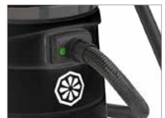
FLEXIBLE HOSE IS LOCKED SECURELY AND RELIABLY