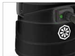
ULTRA-SHOCKPROOF PLASTIC TANK