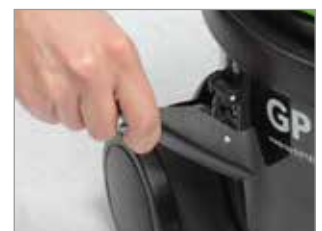
EXTREMELY FLEXIBLE HOOKS