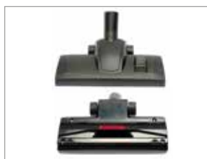
NEW POWERFUL NOZZLE FOR HIGH CLEANING EFFICACY