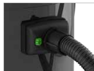
FLEXIBLE HOSE IS LOCKED SECURELY AND RELIABLY